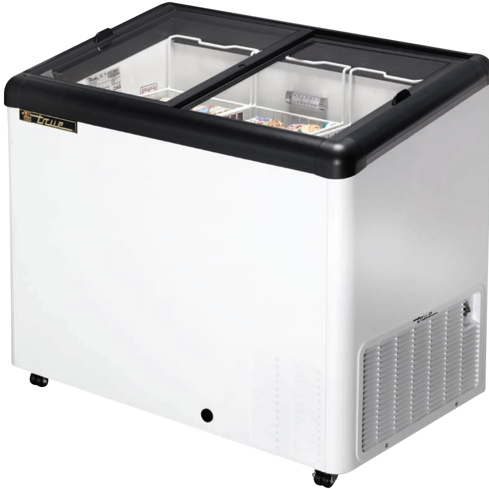
Shown with optional novelty baskets.