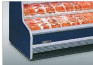
QM53 (3000 SERIES)