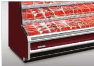
QM51 (2500 SERIES)