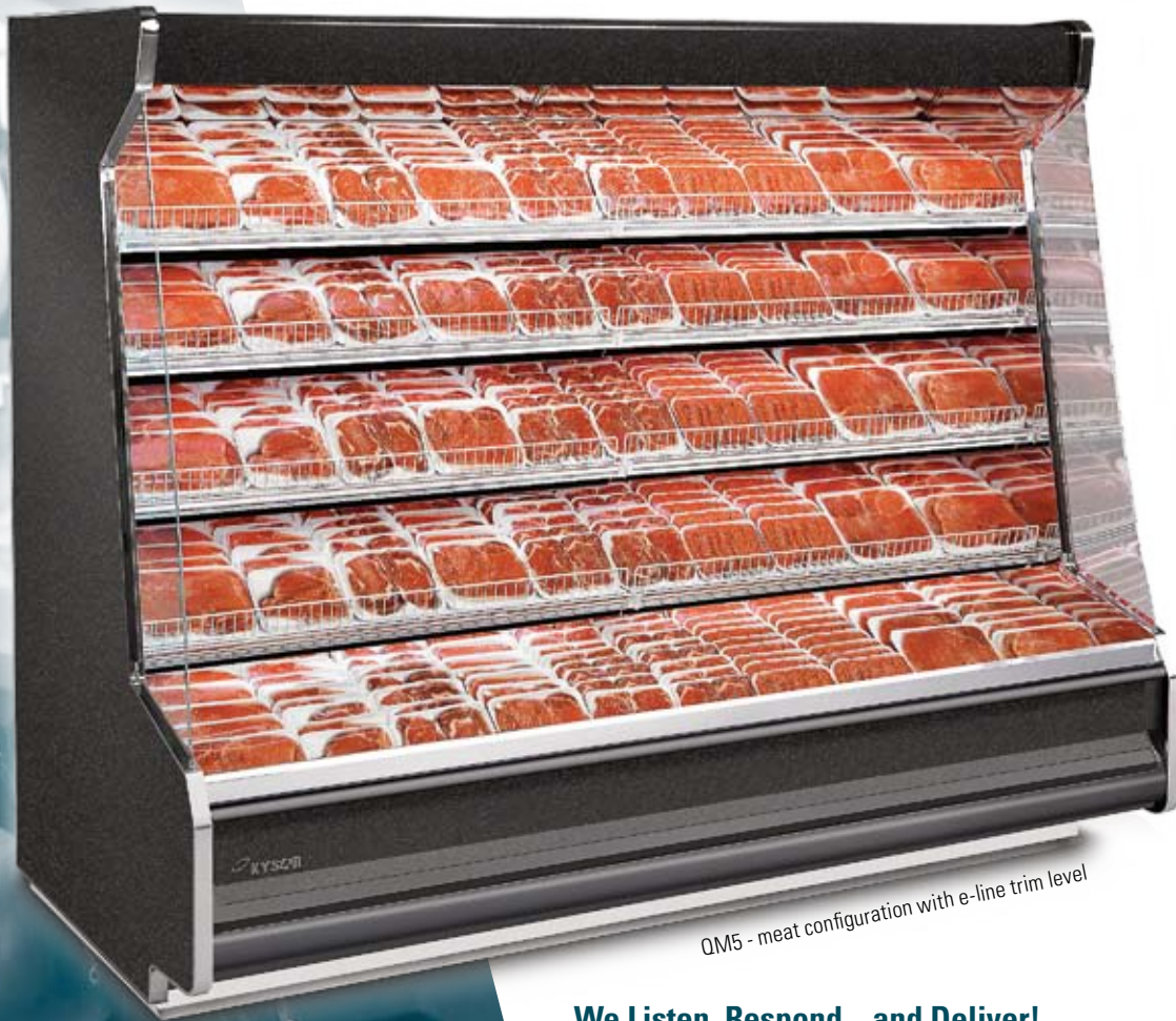
QM5 - meat configuration with e-line trim level