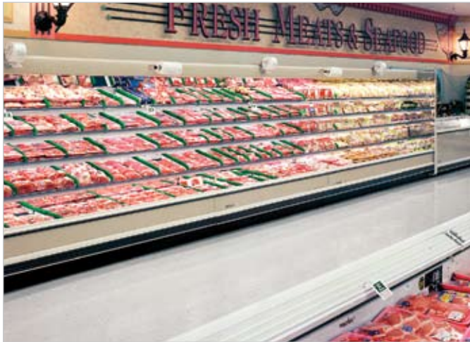
QM53 (3000 SERIES)