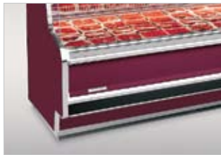
QM4A1 (2500 SERIES)