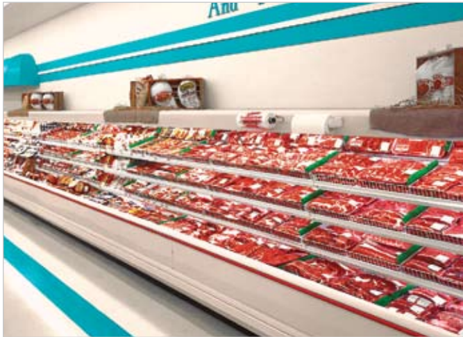
QM4A3 (3000 SERIES)