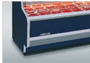
QM4A3 (3000 SERIES)