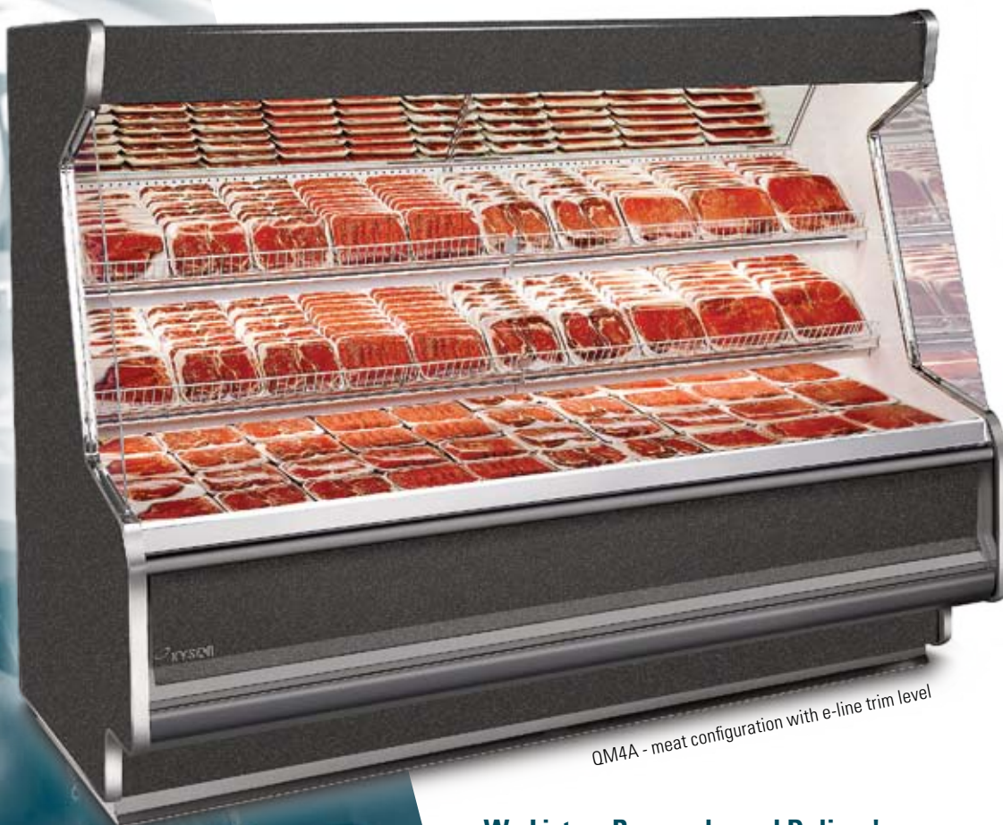
QM4A - meat configuration with e-line trim level