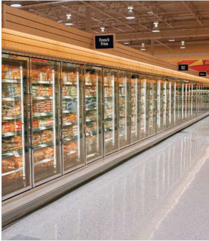
QFGCEI (e-Line Trim)