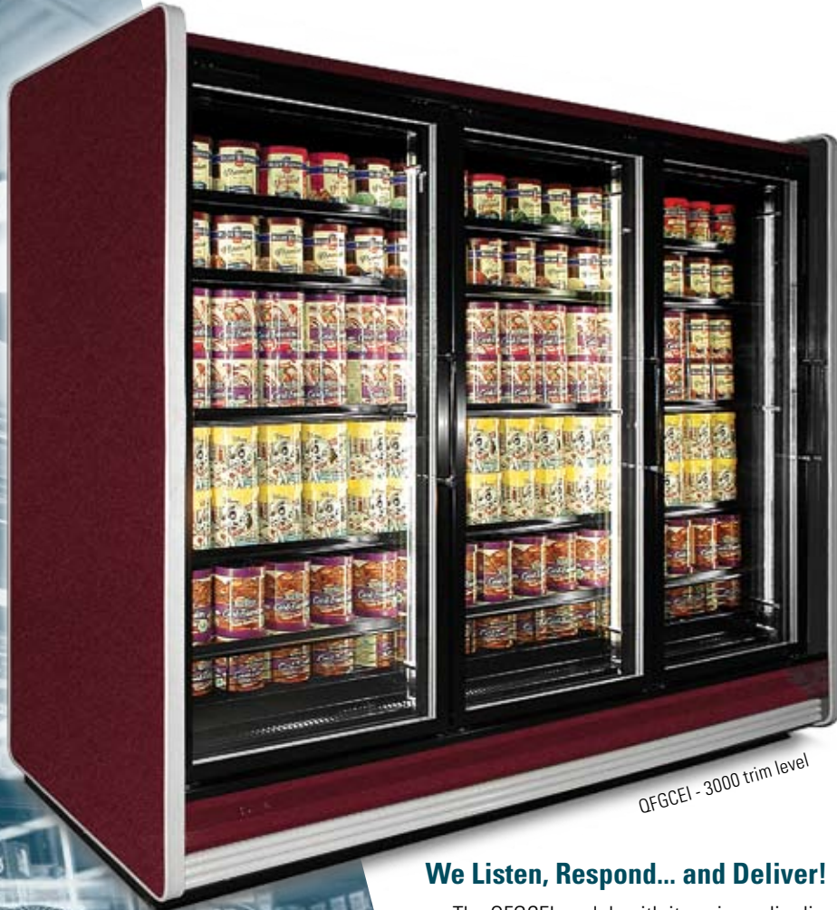
QFGCEI - 3000 trim level