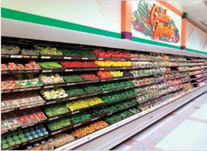
QD63 (3000 SERIES)