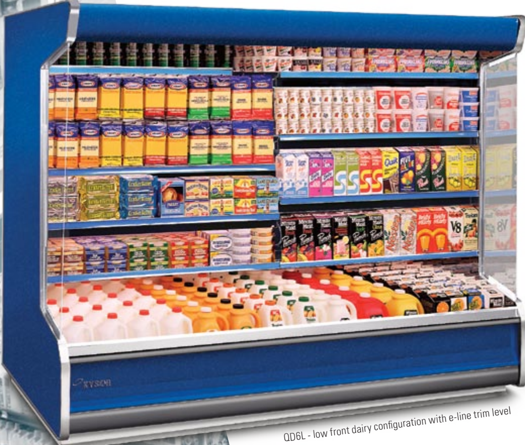
QD6L - low front dairy configuration with e-line trim level

The energy saver model QD6 offers tremendous profit potential. Its unlimited versatility makes this case ideal for merchandising dairy items. Products can be attractively displayed in a variety of methods to increase customer convenience, as well as increase impulse buying. This model features multi-position shelves and open access to product. The QD6 is easily cleaned and extremely energy efficient. The 4 foot model can be utilized as a spot merchandiser for special displays. There are also low and high front models available.