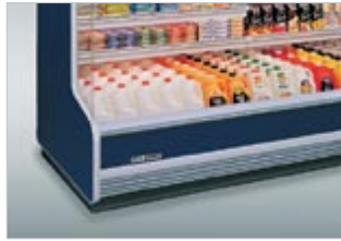
QD63 (3000 SERIES)