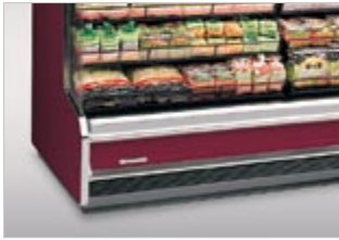
QD61 (2500 SERIES)