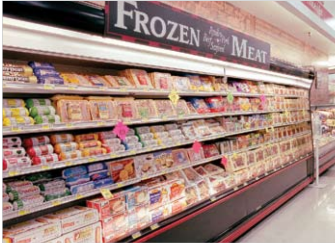
L5A3 (3000 SERIES)