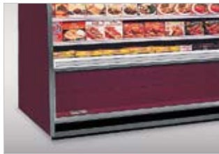
L5FA1 (2500 SERIES)