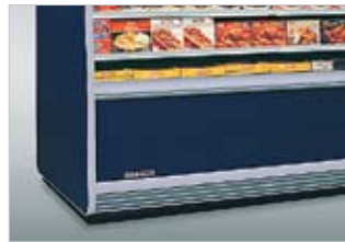
L5FA3 (3000 SERIES)