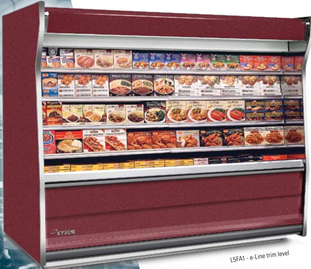
L5FA1 - e-Line trim level