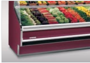
H3ZVP1 (2500 SERIES)