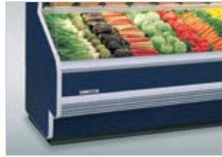
H3ZVP3 (3000 SERIES)