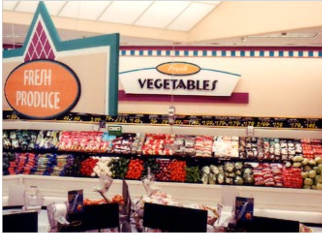
H3ZVP3 (3000 SERIES)